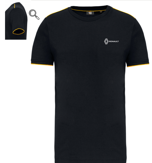
REF : K3020NJA