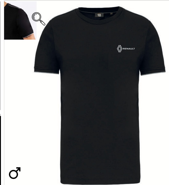
REF : K3020NGR