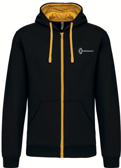
REF : K466NJA