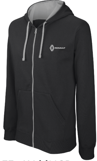
REF : K466NGR